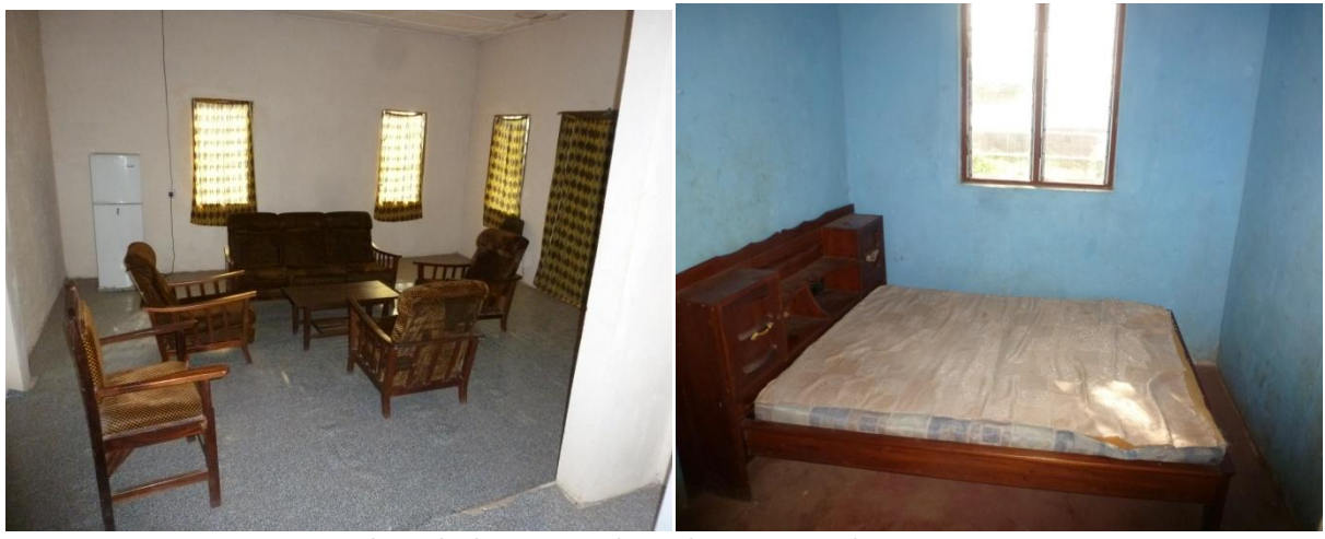
Each two bed room guest house has a common living area.