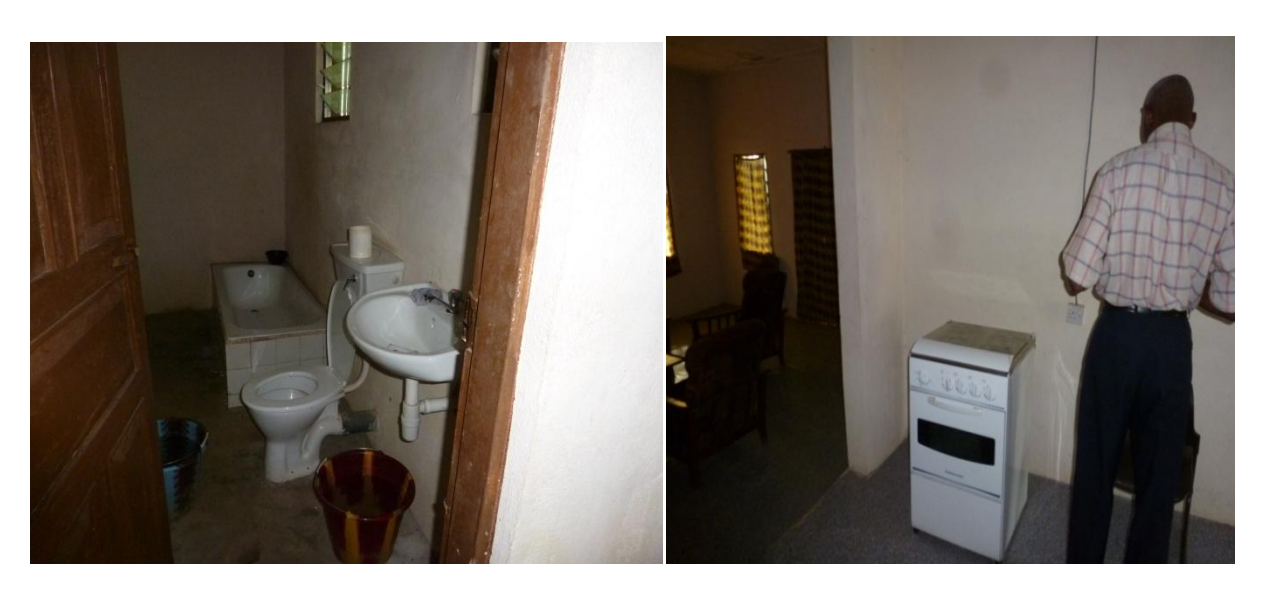
Each two person suite has a bathroom and a small stove.