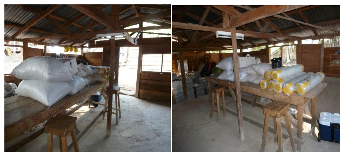
The bags contain ground nuts and maize. The black plastic bags visible in the right photo contain tomato, okra, pepper, and egg plant seeds. The rolls of plastic are for the 13 shelters' solar panels.