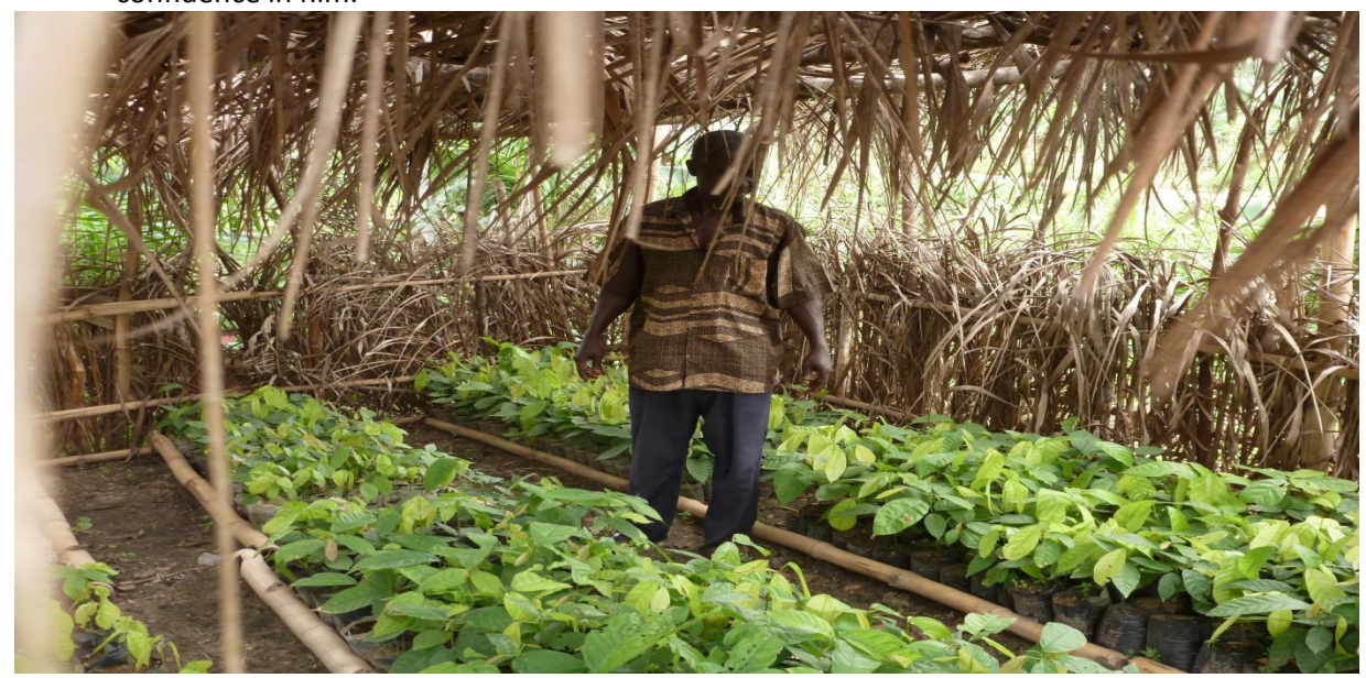
Samuel Mborka's hybrid cacao seed nursery

Upon arrival in Freetown East, I purchased 7 rolls of solar panels from Shanderkas for cacao Phase II construction of 13 shelters.