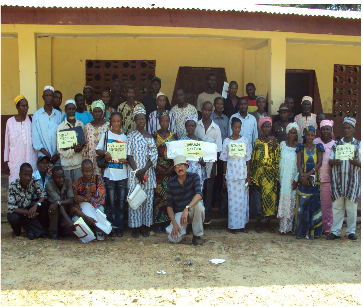
Workshop is finished. A proud group really stepped up to the challenge of exchanging ideas and discovering some stretch actions for the individual sections and the Chiefdom.

Here are the Penguia Chiefdom level goals for increasing sustainable agricultural development to ensure food security and increased revenue from commercial agriculture production: