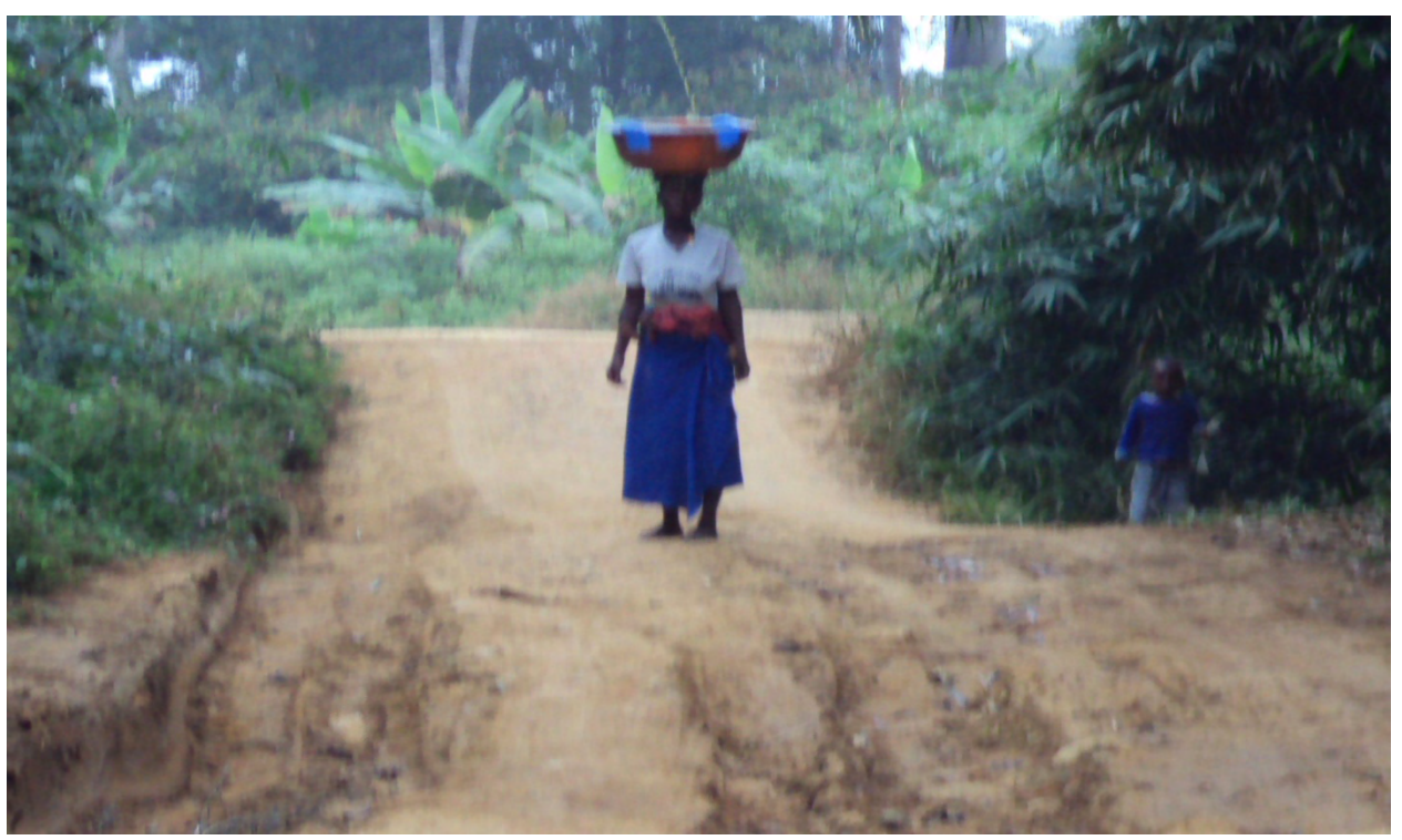
A woman leaving the new Woroma concrete bridge approaches the eroded portion of the road.