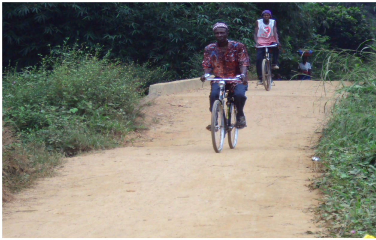
Roads to and from the new concrete bridges held up well, however there is serious erosion from the bridge roadway heading toward Manowa.