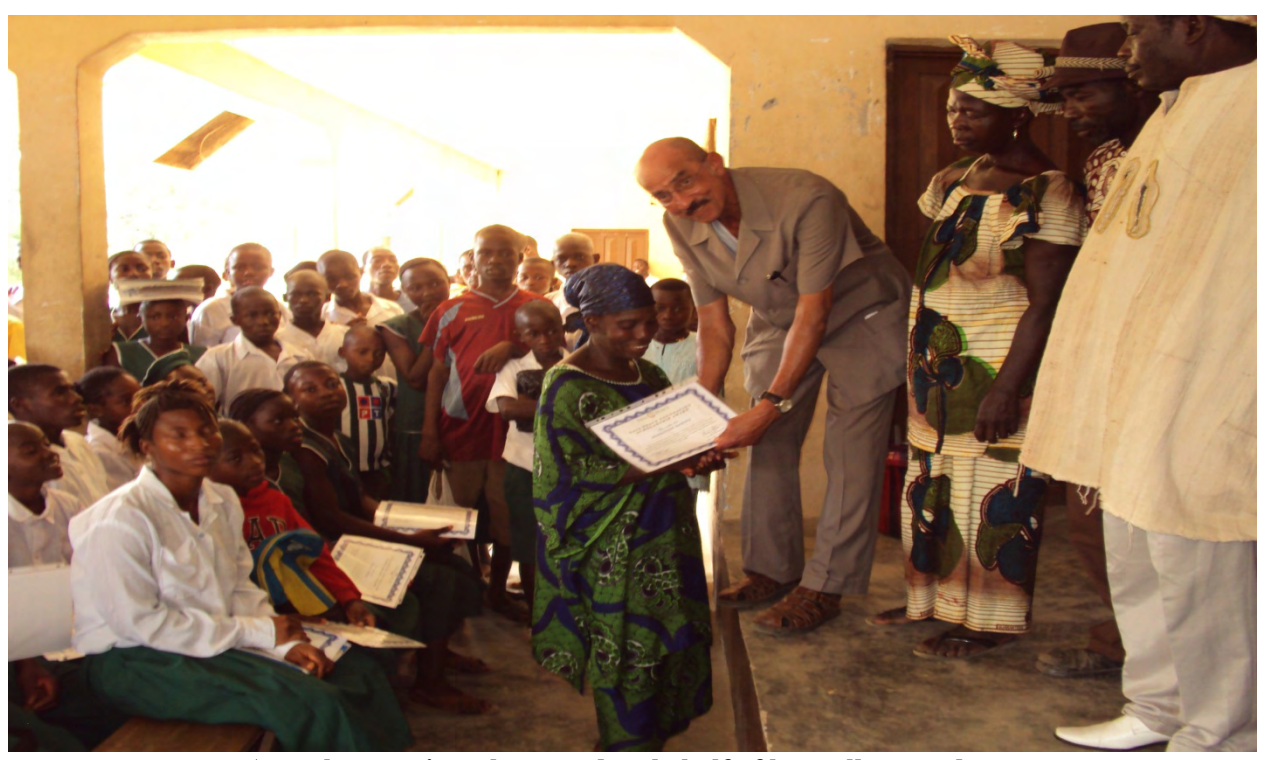
A mother receives the award on behalf of her college student.