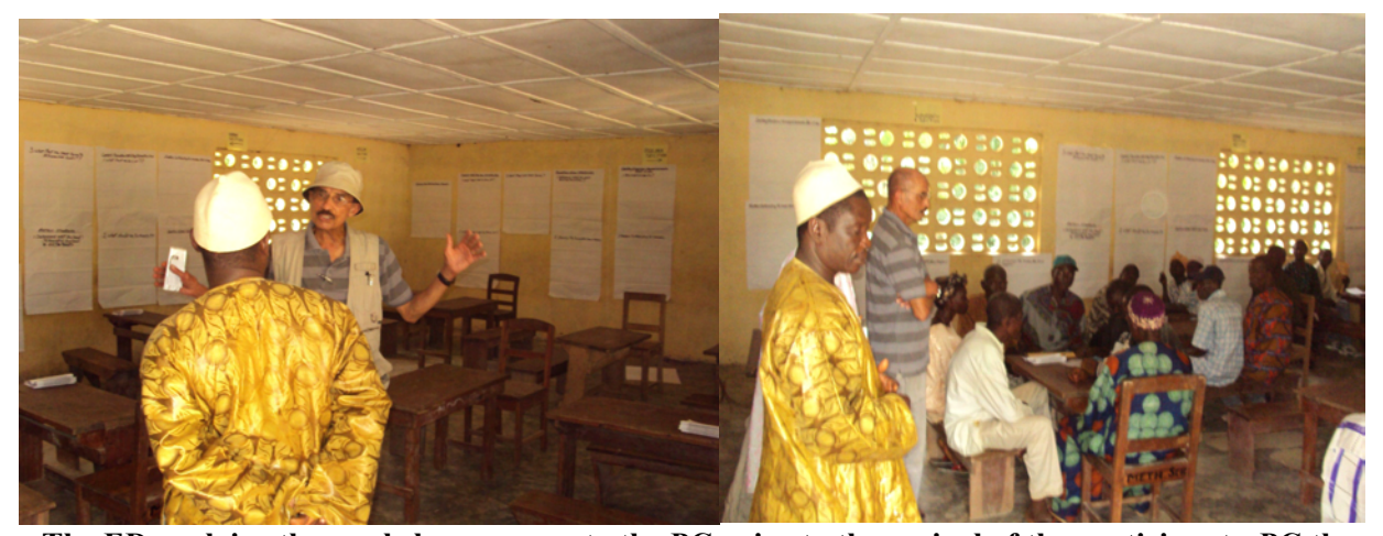
The ED explains the workshop process to the PC prior to the arrival of the participants. PC then leads traditional Muslim and Christian prayers that always precede a collective endeavor.

The photos below show the workshop in process. The results of the strategic visioning will follow the photos.