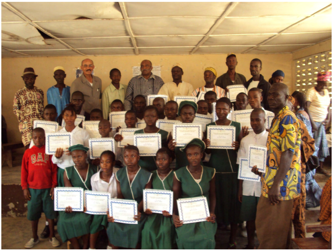
The ceremony ends.

At the close of the ceremony, the PC thanked TPF for supporting education in the Chiefdom. The audience applauded this contribution to the education of their children.