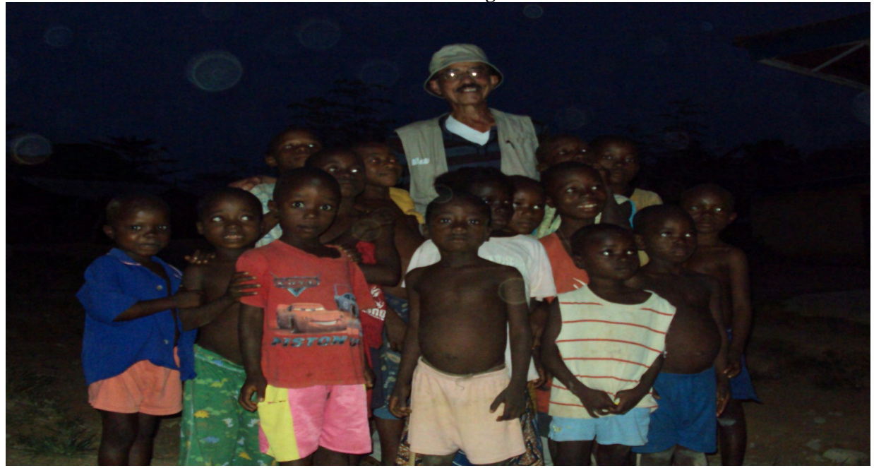
As we prepared to leave, children were all over these strangers, so we took a photo—some smiles, some poses, some funny faces—at the end of a good day in Yawei Chiefdom.

"This trip covered a lot of ground. The people want to improve their lives and especially the lives of their children. If there is to be sustainable peace, there must be sustainable development that nurtures hope and make dreams possible. Hopefully TPF and you who read this can contribute to that outcome." – Fred Leigh