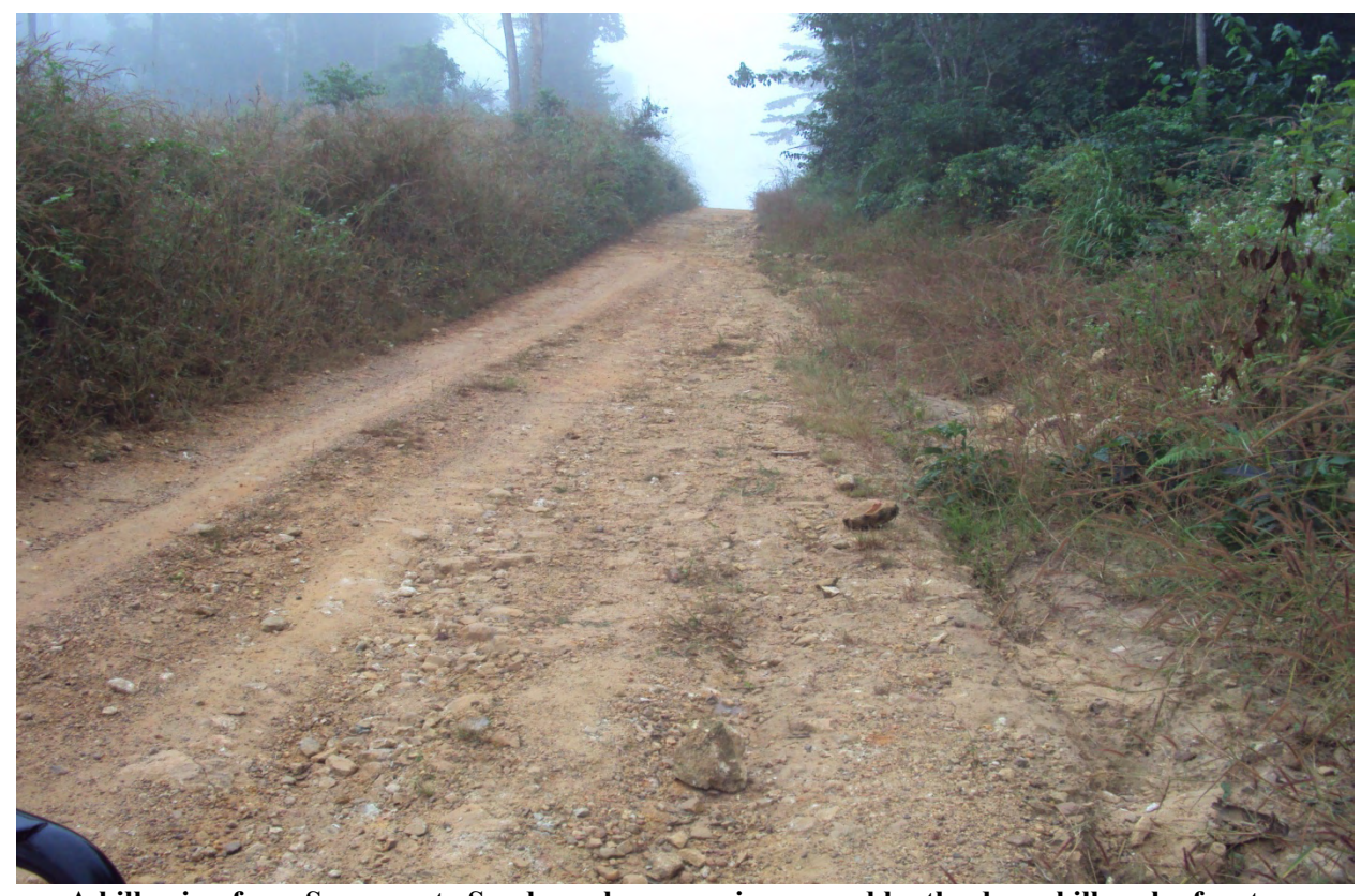
A hill going from Sengema to Sandaru shows erosion caused by the down hill rush of water.