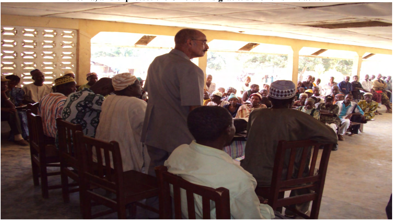
TPF ED addresses the audience and challenges the students to stay committed to excellence.