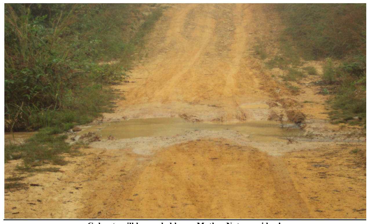
Culverts will be needed here. Mother Nature said so!