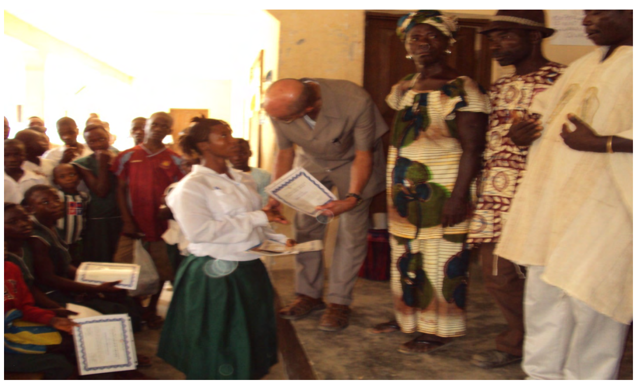
A secondary student receives her award.