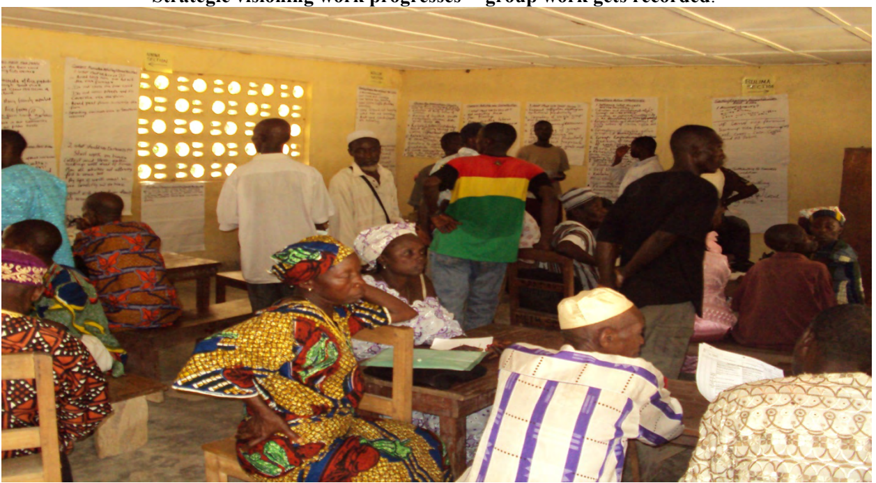
On day 2, the recorders for each section examine other section's results to identify and discuss concurrences that point to chiefdom issues, outcomes, and goals.

Strategic visioning work progresses -- group work gets recorded.