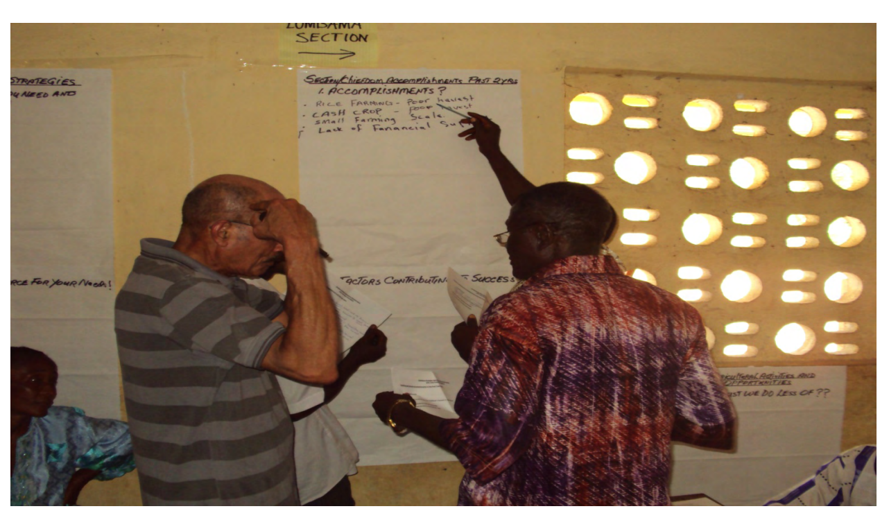
ED and recorder discuss accomplishments in the past two years.