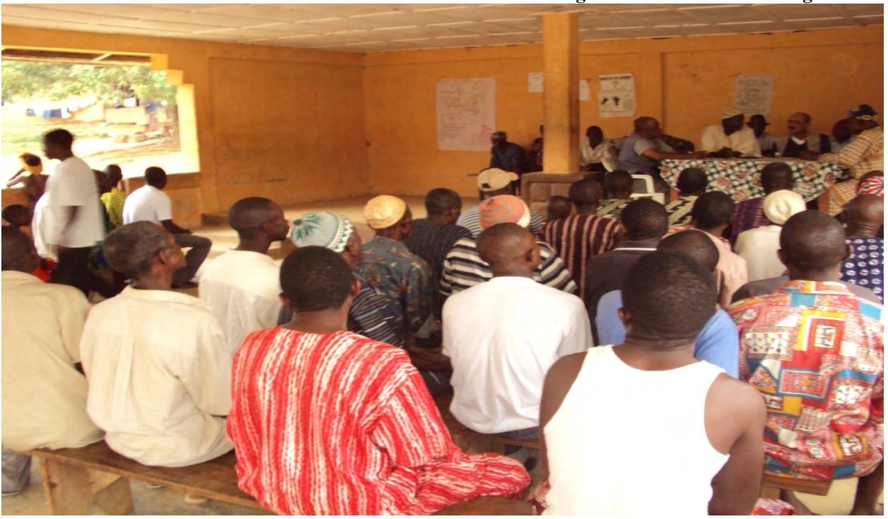
A view from the audience -- we noted that no women were present, so in our learning for effective partnering within Yawei Chiefdom, we will need to know and be sensitive to the culture in this chiefdom. Women would have been present in Penguia Chiefdom.