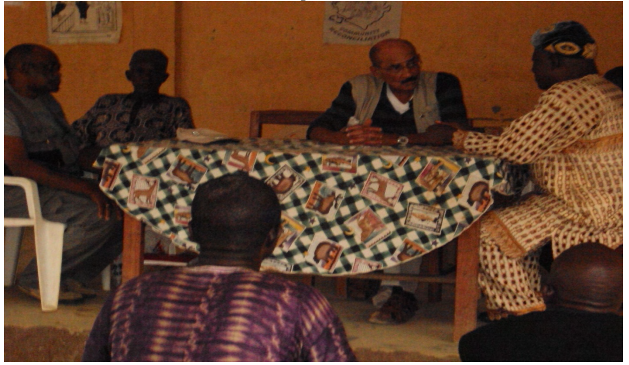
TPF ED and PC Keketey engage in "getting to know each other palaver".