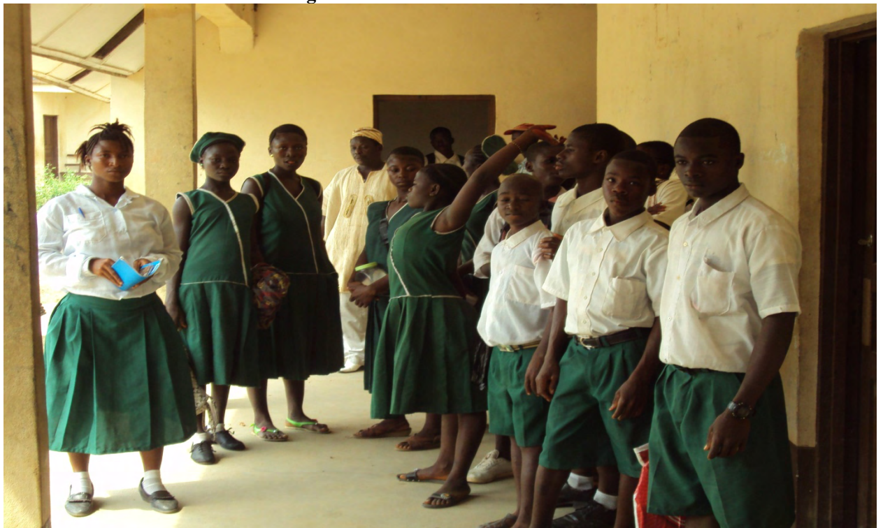
The students wait to march in for the award ceremony.

The Meeting ends -- TIME FOR THE CEREMONY.