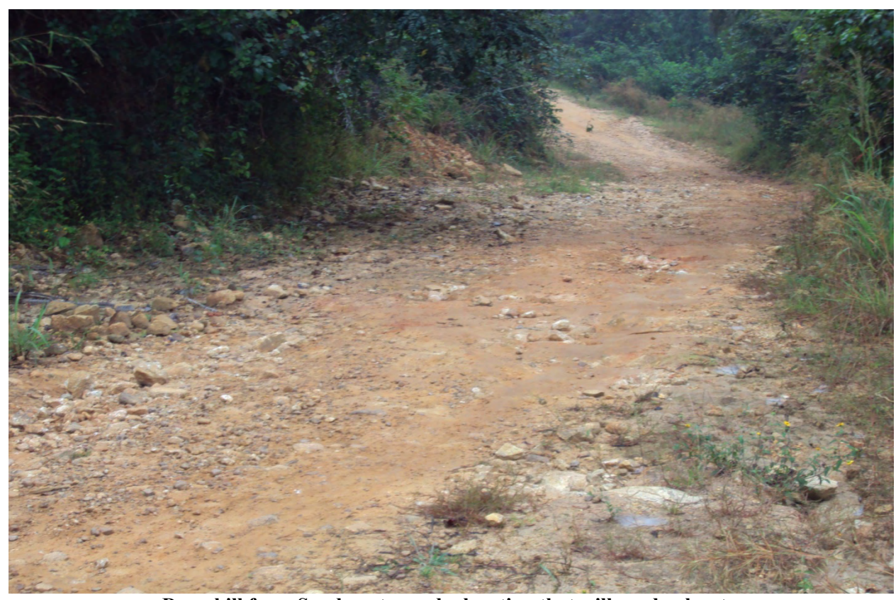
Downhill from Sandaru toward a location that will need culverts