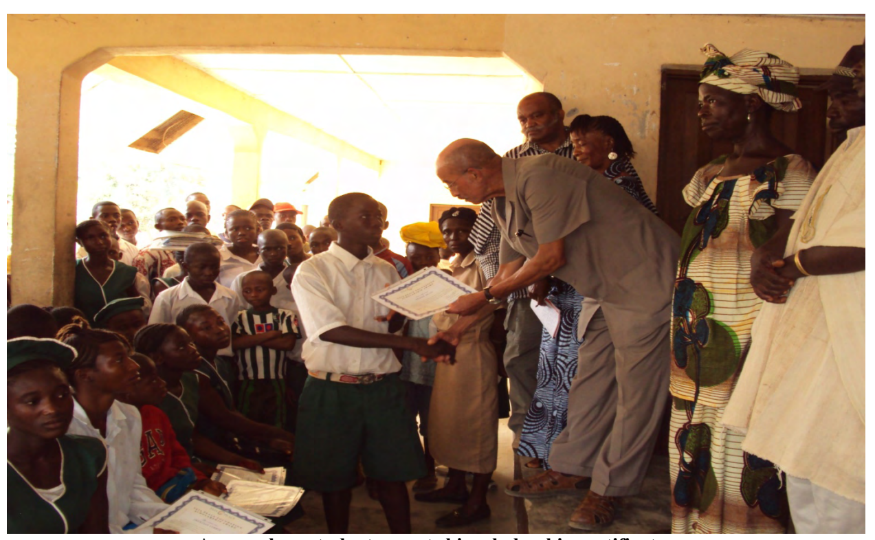
A secondary student accepts his scholarship certificate.