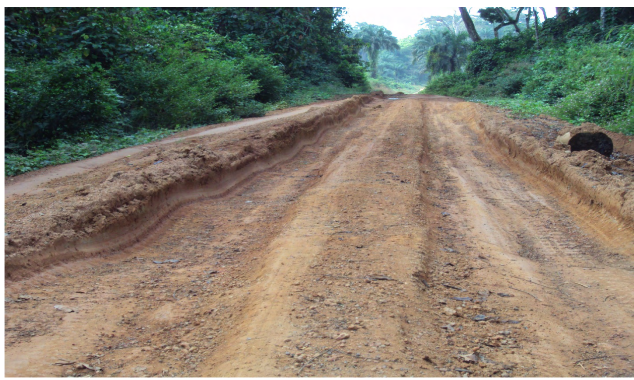
Looks bad, but a good surface -- ditching, re-grading and a roller will fix this.

The photos focus on examples of where there is significant repair and finishing work required. During this trip we traveled several roads in Kailahun District and the Manowa-Sandaru road is clearly the best of the dirt roads despite the damage caused by the rains and the work not yet finished when the seasonal rains forced a work stoppage. When this final phase of work has been accomplished, SLRA, the people of