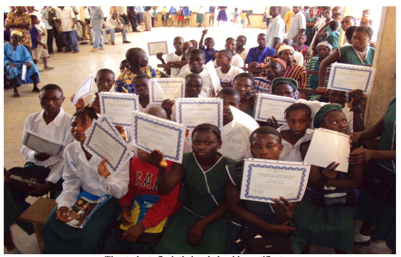
The students flash their scholarship certificates.