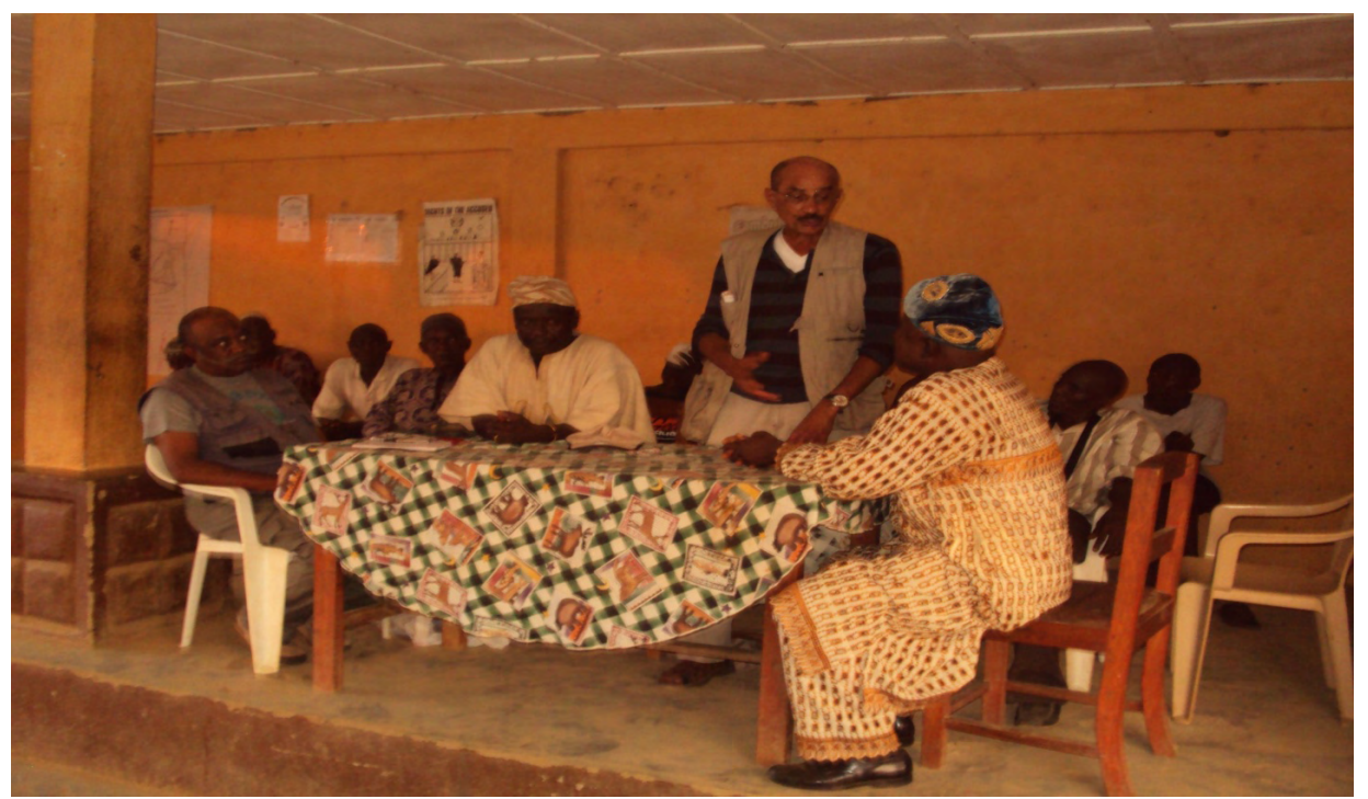
TPF ED describes the Taia/TPF philosophy as it relates to sustainable development and the TPF role in working with the Chiefdom leadership and people to build good partnerships whereby all benefit from this the left hand right hand collaboration.