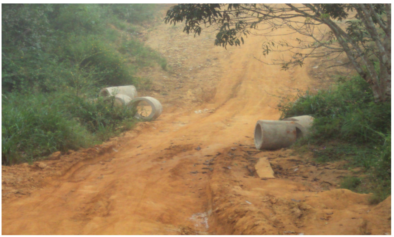
Culverts prepositioned by SLRA. Note the forest canopy over the roadway -- this keeps the road from drying, thus trees will be cut back in such areas.