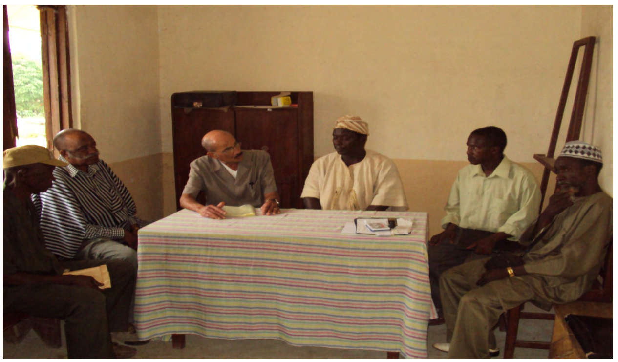
TPF ED answers a question about the scholarships prior to the arrival of other participants.