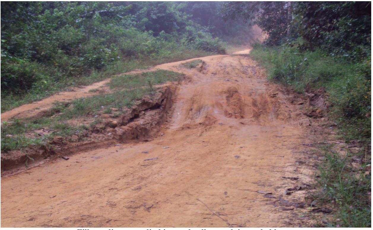
Fill, grading, new ditching and roller work is needed here.